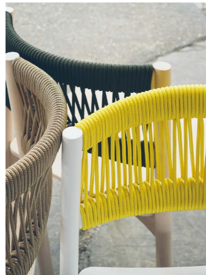
Rope backrest of the Lima collection