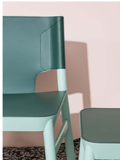
Hide only Timpani chair and stool

Hide - an emerging design trend stemming from seventies furniture design, hide only upholstery includes no filling at all and therefore does not require FR treatment.