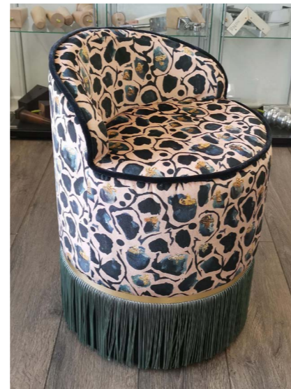
Bespoke Marshmallow stool with fringe detailing