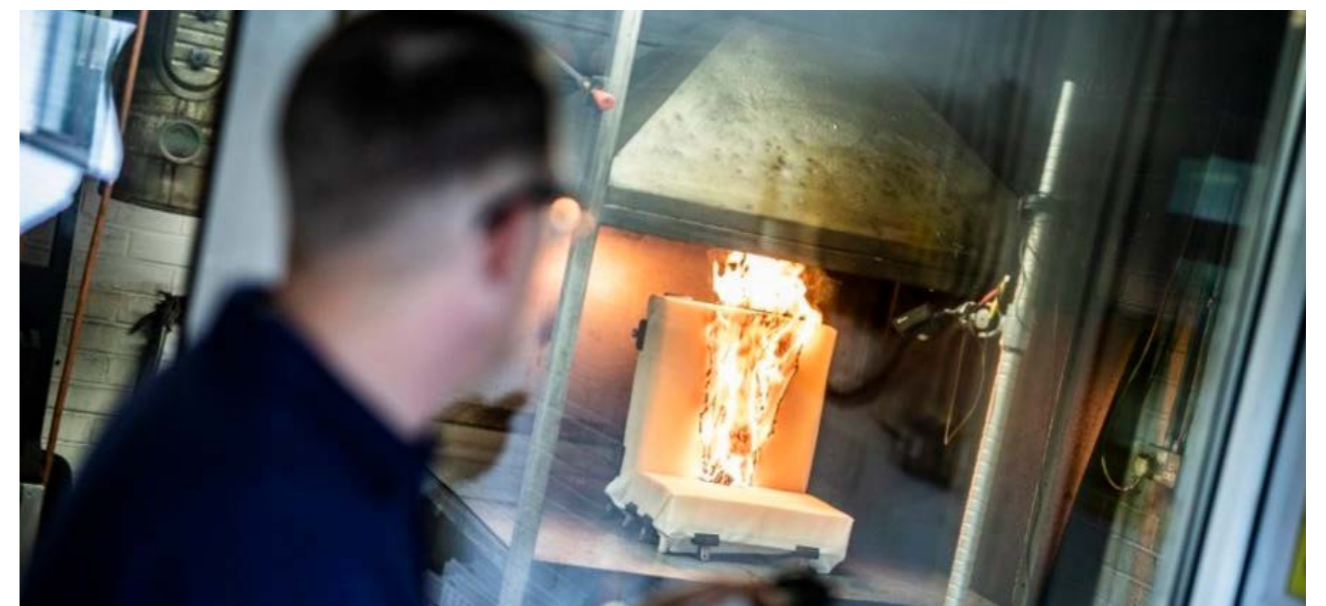
FIRA UK Crib 5 testing.